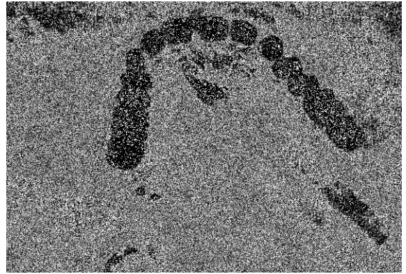
4. tan midget point hard-to-reach