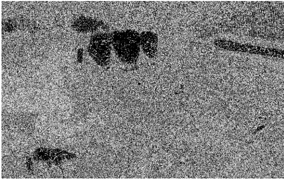
2. brush wheel