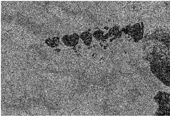
3. rubber cup pumice