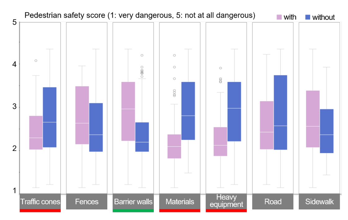
Figure 3. Boxplot of environmental impacts on pedestrian safety

Conversely, for factors with negative values in the mean difference, such as traffic cones, materials, and heavy equipment, significantly lower pedestrian safety scores were observed when these objects were present compared to when they were absent, as indicated in Table 3. This is because traffic cones often indicate ongoing construction activity or hazards, causing pedestrians to perceive higher risks. Similarly, the presence of construction materials and heavy equipment can create obstacles and reduce the available space for pedestrians, leading to a heightened sense of danger to pedestrians. On one hand, the presence of fences and sidewalks slightly raised pedestrian safety scores, while the presence of roads slightly lowered them. However, there was no statistically significant difference in the mean pedestrian safety. Factors that significantly improve pedestrian safety, such as barrier walls, are highlighted in green. In contrast, elements that have a statistically significant negative effect - such as traffic cones, materials, and heavy equipment - are marked in red.