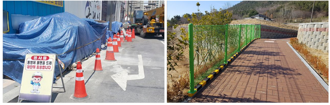
(a) Experimental dataset

This study collected photos of streetscape areas near construction sites by utilizing a web scraping tool to extract images from Google Images (https://www.pullywood.com/ImageAssistant/). The collected photos underwent manual screening, and any photo that did not include at least one of the seven specified environmental factors was removed from the dataset. Photos with resolutions below 320*320 or above 1920*1080 were also excluded from the dataset. To supplement the dataset, artificial intelligence-generated images were created using text-to-image models (https://www.bing.com/images/ create). Consequently, a total of 216 photos were collected to serve as a control dataset. The number of environmental factors found in a single photo ranges from 1 to 6. As an example, the representative photo from the control dataset, illustrated in Fig. 2 (b), solely features sidewalks. Among the seven types of environmental factors, excluding roads and sidewalks, barrier walls are the most frequently observed in the experimental dataset, appearing in 98 out of 216 photos. Table 1 provides an overview of the frequency of occurrence of environmental factors across the two datasets.