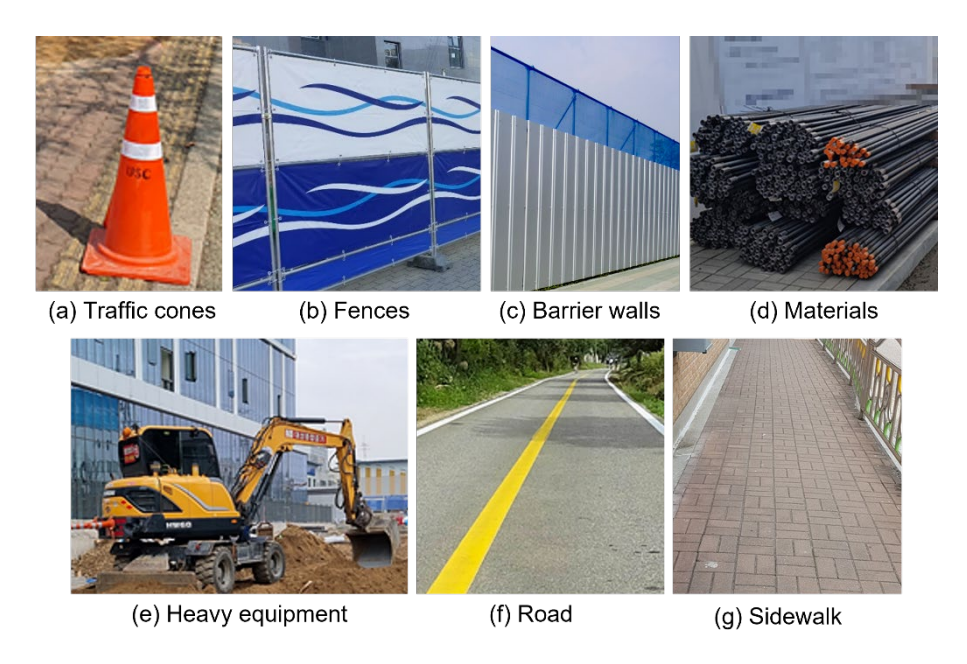
Figure 1. Environmental factors pertaining to pedestrian safety