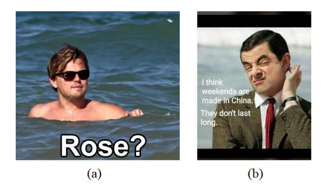
Figure 1. The image above shows two examples of meme images. The first image (a) is a funny meme, while the second image (b) is a meme with racist text.

Meme images are pictures with embedded texts that are meant to provide amusement for the audience. However, some memes convey harmful messages and are unsafe to view by certain people. For this reason, a challenge called Memotion [1] is introduced to classify the sentiment, emotion, and intensity of the meaning of meme images using machine learning or deep learning techniques. Most solutions combine the image and textual features in a multimodal setup, such as in the work of Nguyen et al. [2]. However, the results show that encoding images is the main challenge for the task. This is because meme images contain embedded images and texts. Models tend to read the text rather than see the objects inside the image. It is important to recognize the picture minus the text to fully understand the meaning behind the meme. Figure 1 shows an example of meme images.