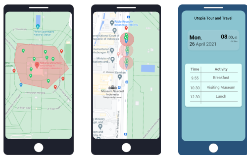
Figure 1. Geofence Scenarios

There are two scenarios in the usage of geofence technology. First, the tour guide can set a polygonal geofence when arriving at a particular place. Second, the tour guide can set a geofence when the tour is on the move from point A to point B, thus the geofence will follow the tour pack. Both cases are illustrated in the figure below.