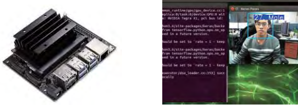
Figure 2: Jetson Nano board and executing age/gender estimation

Even though our network has a larger volume of parameters, it is still a light-weight model and has more functionality and produce much better result compared to SSR net.