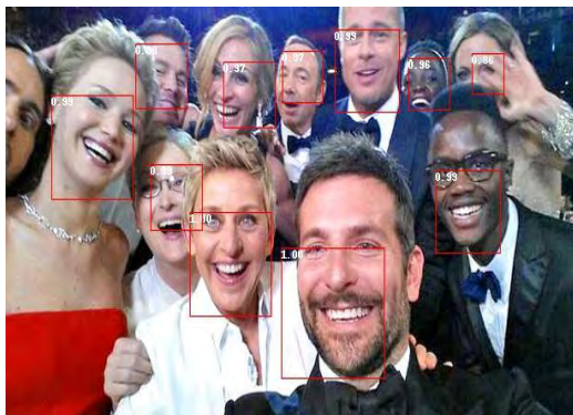
Figure 1. Detected faces using DDFD [2]

Detecting faces in different sizes is one of the most important part in every single face detection methods. Even there is only one big sized face, current some methods check a number of different sizes of faces [1]. It spends resource for unnecessary operations and increase detection time. As shown in Figure 1, DDFD [2], for example, scales image 10 times from bigger to smaller.