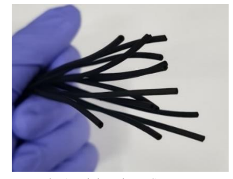
Fig. 1. Fabricated MWCNT-HM.

MWCNT-HM possessed a porous, hollow-fiber structure by interconnection of MWCNTs (Fig. 1). MWCNT-HM has 77.8 m^2/g of specific surface area, and 13.9 nm of BJH pore size, which is effective for water flow through the MWCNT-HM and electrochemical Co<sup>2+</sup> removal.