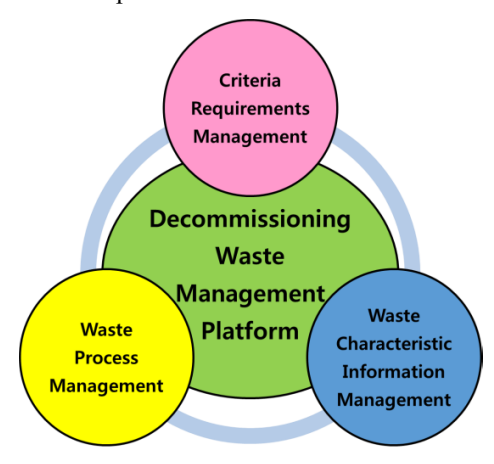
Fig. 2. Dismantling waste platform structure.

standard structure manages three areas: the requirements, the waste characteristics information and the waste process.