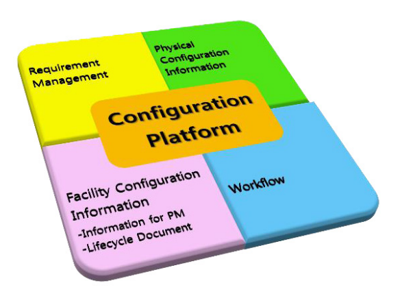
Fig. 3. Configuration management platform.

The configuration management platform consists of requirement management, facility configuration information, physical configuration information, and workflow platform as shown in Fig. 3 [2].