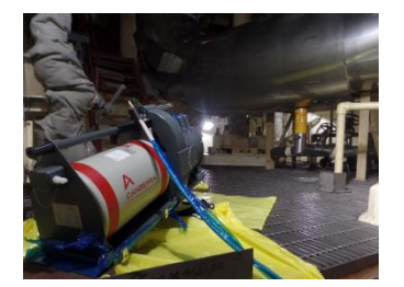
Fig. 1. Measurement position of ISOCS.

The contact dose rate of RCP Suction Leg B was estimated to be 2 mSv/h at maximum, and the detector was located 254 cm from the surface of RCP Suction Leg B as shown in Fig. 1 to satisfy dead time within 10%. And an absorber of 3.95 cm (lead: 2.75 cm, stainless steel: 1.2 cm) was placed in front of the detector and measured for 1,000 seconds.