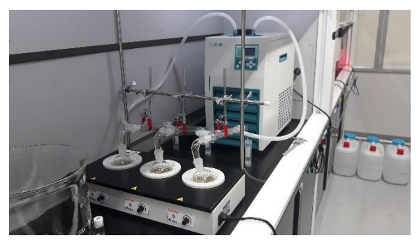
Fig. 2. Tritium Pretreatment (Heat Exchange Cooler).

After calibration, pretreated samples are detected in LSC. In the case of and gross \beta , only river water samples are pretreated. Because there is much natural radionuclide like potassium, so artificial radioactivity detection results can be incorrect. According to TDS value, 10 mL or 250 mL of each river sample are