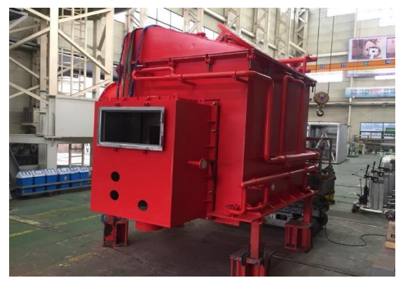
Fig. 3. Large-capacity KHNP Plasma Melter.