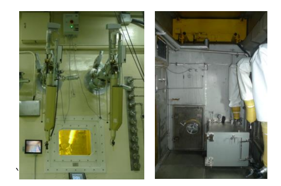
(a) View from OA(b) View from ACFig. 1. Constructed Argon Cell.

dimensions of 600 (L) x 600 (D) x 600 (H) mm was installed between the cells as a means of transferring material between the air cell and the argon cell. In addition, a gastight emergency door with an internal size of 600 (L) x 1,000 (H) mm was installed for situations during the construction and emergency operation of the argon cell.