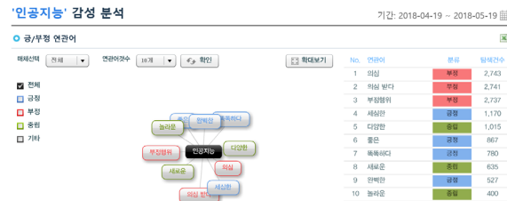
Fig. 3. Associated word of positive / negative (Sensitivity analysis)

Next, figure 3 is an associated word of positive / negative (sensitivity analysis) of “Artificial Intelligence” search word. The most frequently mentioned emotional analyzes during the analysis term were the Doubt (2,743) and the Be suspicious (2,741).