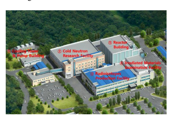
Fig. 2. Decommissioning Sequence for the Research Reactor and Related Facilities.

2.2.2 Decommissioning Process. Dismantling preparation works are decontaminated solid waste, are equipped with temporary storage facilities, entrance and control facilities, changing rooms, ventilation facilities, and utilities for dismantling. In addition these are unnecessary interrupted utilities, are isolated from compartments and ventilation facilities, and so on. A research reactor consists of a reactor building, isotope production facility, irradiation material examination facility, cold neutron research facility, and accessory facilities [3]. The dismantling of Hanaro was planned in order of the accessory facility, cold neutron research facility, isotope production facility, irradiation material examination facility, and reactor building, and excludes the utilities required for dismantling, as shown in fig. 2. In the dismantling process of the research reactor, the order of dismantling from the facilities with a low radioactive level to the facilities with a high radioactive level was selected.