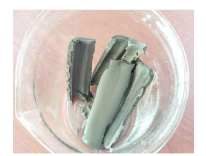
Fig. 3. Cake Morphology of BaSO<sub>4</sub> Precipitates.

metal ions (higher than 99.5%) were removed from the decontamination solution to solid. It means that only 0.5% of anion and metal ions can be removed by ion-exchange resin.