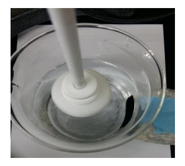
Fig. 1. Magnetic separation with permanent magnet.

The efficiency of separation is evaluated by batch magnetic process. The permanent magnet captured magnetic MWCNTs-ZnFC-1 and magnetic MWCNTs-ZnFC-2 while 700 mL DI water stirred with 250 rpm for 1 minute. Fig. 1 shows the separation procedure.