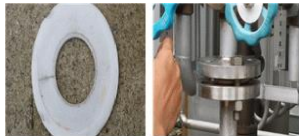
Fig. 2. Damaged gasket and piping.

This facility uses liquid argon as needed, and the characteristics of the liquid argon are frequently caused by the degradation of the gasket and deformation of the piping as shown in Fig. 2.