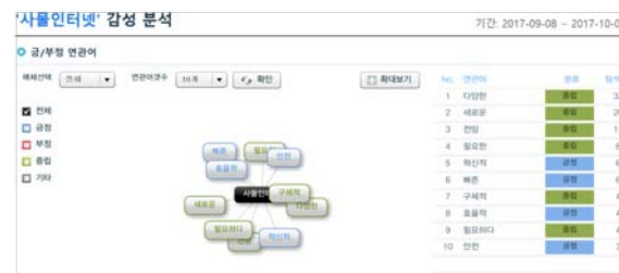
Fig. 3. Associated word of positive / negative (Sensitivity analysis)

Next, figure 3 is an associated word of positive / negative (sensitivity analysis) of "Internet of things" search word. The most frequently mentioned emotional analyzes during the analysis term were the various (326) and the new (226).