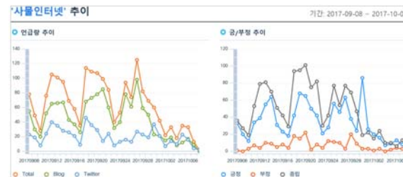
Fig. 2. Trend of reference frequency

Next, figure 2 is trend of reference frequency of "Internet of things" search word.