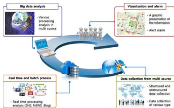
Figure 1. The process of the proposed service

proposed service. The proposed system collects the various types of data that is classified into structured, semi-structured, and unstructured types, and processes and stores the data. It provides a user with the current location and surrounding information through various analyses of the stored data, the input information of the user, and GPS location information using smart devices. When a risk occurs, the proposed service notifies a user immediately.