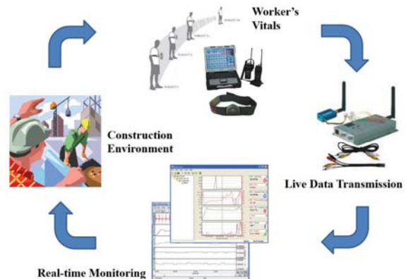
Figure 2. Framework of Real-Time Health Surveillance Using Bio-sensors [12]

device equipped with omni-directional antenna which can identify tagged items up to 110 yards around it. Microwave 2.45 GHz Motion Sensor Active Tag is used for identifying and performing motion observation of workers.