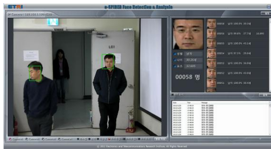
Figure 2. The proposed people counting system based on face detection and tracking.

People counting accuracy is described in Table 1. The average counting accuracy is 95.2% and the lowest counting accuracy is 88.2% for ETRI DB2. The reason for inferior counting accuracy for ETRI DB2 is several face detection failure occurs in ETRI DB2. The processing speed of the proposed system shows over 20fps which is sufficient for real-time applications.