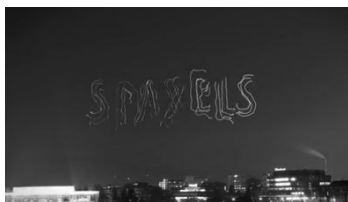
Figure 2. (a) Lightpainting with Spaxels

Figure 2 (a) shows that Lightpainting with Spaxels prove their skills paint logos and animation into the sky a number of times [4]. The Spaxels, the three dimensional pixels that the Ars Electronica Futurelab in Europe has created based on a quad-rotor technology, has a light source in itself. The Spaxels have flown into the sky and shed a colorful light in Bergen International festival as shown in Figure 2 (b) and Linz [5].