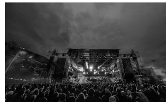
(b) Lightpainting with Spaxels