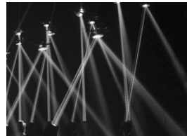
(b) Dance to music with light

Figure 2 (a) shows that Lightpainting with Spaxels prove their skills paint logos and animation into the sky a number of times [4]. The Spaxels, the three dimensional pixels that the Ars Electronica Futurelab in Europe has created based on a quad-rotor technology, has a light source in itself. The Spaxels have flown into the sky and shed a colorful light in Bergen International festival as shown in Figure 2 (b) and Linz [5].