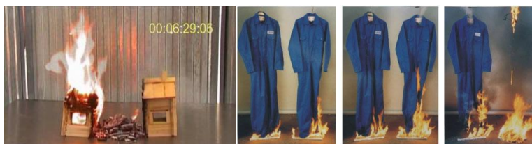
Figure 1. Example of Flame Retardant 1 (with halogenated flame retardant)

There are three types of flame retardants: addition form, reaction form, and inorganic form. Addition form is used for mixing in a mechanical or physical way with base polymer resin to show flame retarding characteristics. Reaction form is for chemical bonding with high molecular resins to make flame retarding element bonded to base resins, or itself is a flame retarding high molecular resins. Retardant aid such as antimony oxide or aluminum oxide to support and help the effect of flame retardants is classified as inorganic form.