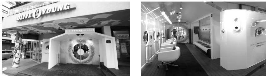
Picture 1. Construction of ACUVUE EYEDEFINE STUDIO, Olive Young, Myoung-dong, Seoul