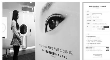
Picture 2. Registration and Recording of consumer Irises Process

In the next step of ACUVUE interactive digital media experiences to obtain the identity of each consumer, personal information was registered along with recordings of the face and irises.