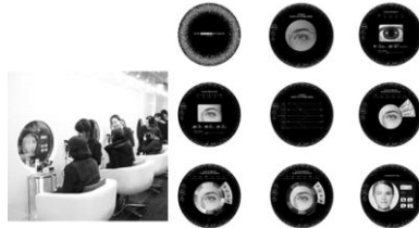
Picture 3. Eye analysis and eye makeup services

The virtual eye makeup was processed in steps of ① eyebrows, ② eye shadow, ③ eye line, ④ mascara, and ⑤ point makeup.