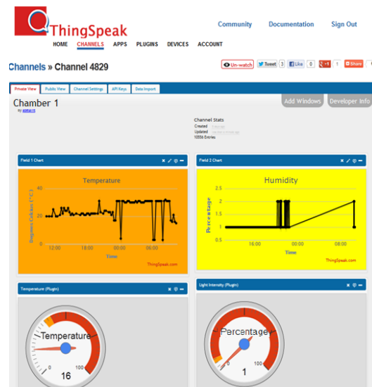
Fig.2 ThingSpeak Sensor Cloud interface

At the base station, the transmitted data packets from the nodes are received and are prepared for upload to the sensor cloud through Ethernet connection. Data packets received from the nodes are compared with old packets to extract information regarding NFC/RFID tag movements in and out of the chamber (this is important for tracking chamber inventory). Memory card also play important role in storing data during times the internet connection is down. The inventory information is emailed to respective personnel and the rest of the data i.e. temperature, humidity and battery level are uploaded to ThingSpeak sensor cloud.