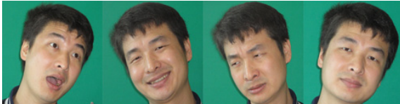
(a0) Surprise (b0) Smile (c0) Angry (d0) Nature Fig. 3. Text image

We selected different facial expression images, Fig.3. as an example, extracted their feature components. Table1 shows the feature components of facial expression.