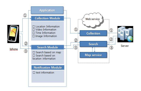
Figure 1. disaster system structure

Figure 1 express the structure of the application system in this paper. This system is split in 4 groups: user, application modules, web service and database server. This system using modules of user interface and service to collection disaster information, and it also can added to disaster information from users and system administrator. This application can quickly transmit all kinds of disaster information to the proposed system.