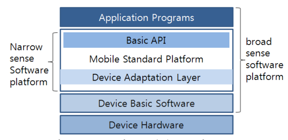
Fig 2. function of mobile software system platform

differentiate but using common operation system can treat as a software.