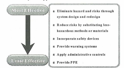
Fig. 2. Actions in order of effectiveness

A hierarchy is any system of actions, things or persons ranked one above the other. For risk practitioners, a hierarchy of controls establishes the actions to be considered in a order of effectiveness to resolve unacceptable hazardous situations. Achieving an understanding of the significance and the rationale for this order is an important step in the continuing evolution of the practice of safety. For many situations, a combination of the risk management methods included in a hierarchy of controls may be applied.