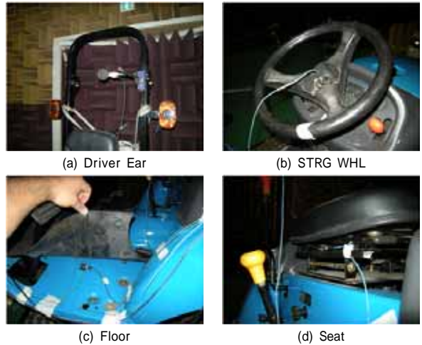
Fig.1 Target responses