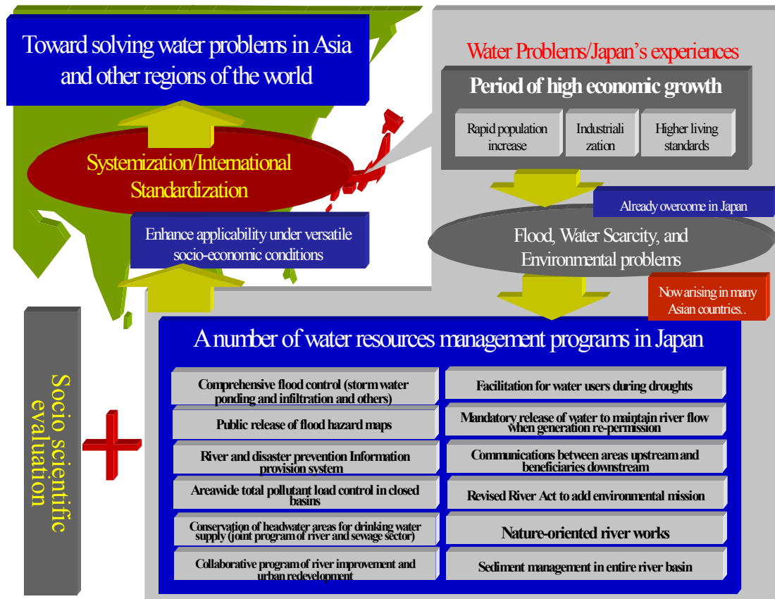
Fig. 1 Conceptual drawing of past experiences in water problem solving and its application to other regions after Musiaki (2000) and Yoshitani (2002)

Even assuming that data are available, the next hurdle is that differing natural conditions prevent the direct application of technology generally used in Japan. For example, the storage function method, which is the hydrological model developed primarily with the purpose of enhancing the accuracy of reproducing via calculation a flood that occurs in a short time, is not suitable for reproducing long-term runoff or floods in arid regions. This is because the predominant hydrological processes differ between rainy, arid and semi-arid regions and wet regions, and the aspects of the hydrological process that can be intensively reproduced by the