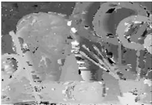
Fig. 2. Horizontal Disparity Map.

For getting 3D image from stereoscopic camera, it is essential to control the vergence. This is done by using horizontal disparity information between left and right images followed by the position of the objects in the image [2].