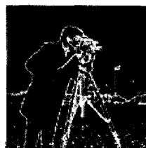
Fig 2. The result directly use Canny algorithm.

Taking the experiment to compare the original Canny with the improved Canny add with mean shift ahead of time, the different is obvious: