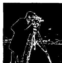
Fig 3. The result use Canny algorithm and mean shift algorithm.

The image processed by the method mention in this paper is better depict the contour of the main objects and fade out the mess outline of grass texture, and suit human vision system.