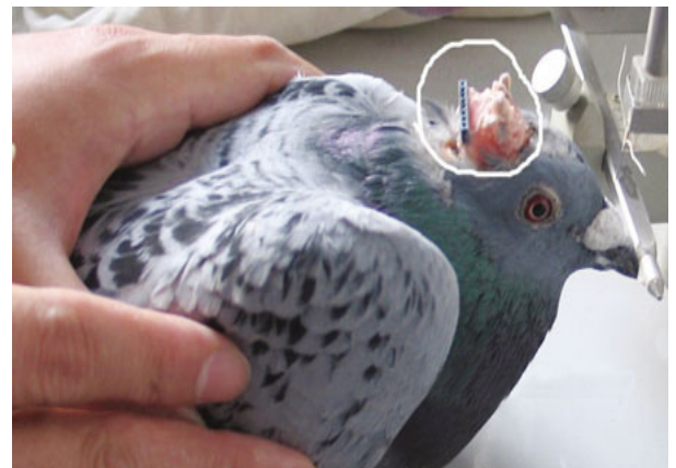
(Fig 2) (a) Pigeon based telemetry stimulation system, (b) The practical controller animal-robots