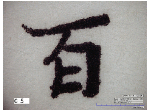
(a) Carbon black

The prepared inks using carbon black and lamp black was tested and its printed properties were compared each other. Through this approach, appropriate inks and manufactures, which are more suitable for restoration documents were considered. In this context, we prepared different components of inks, namely several types of carbon black and lamp black inks. Fig 1. and Fig 2. Show the electro microscope images of printed letter using carbon black and lamp black inks