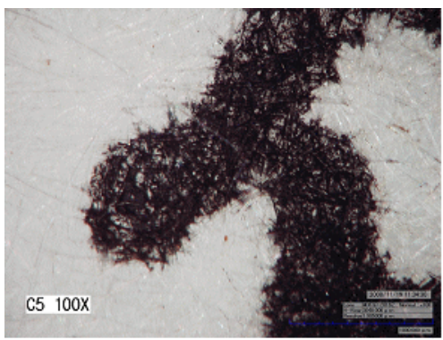
(b) Carbon black(x 100)