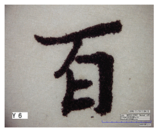
(a) Lamp black