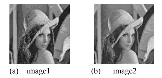
Fig8 Processing result with Kalmann filter

the Kalmann filter was able to be obtained.