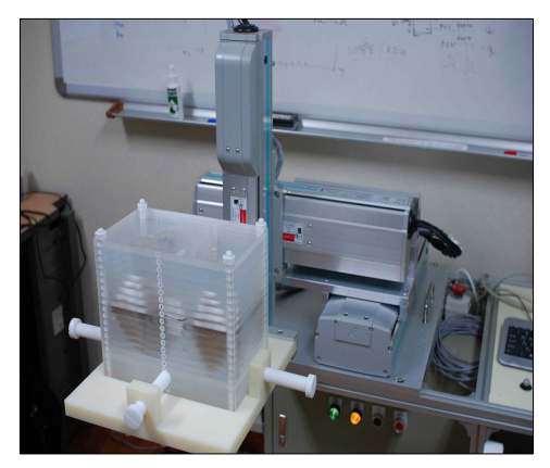
Fig. 1 An in-house moving phantom to simulate 4D organ motion

A 3-axis robotic arm was fabricated and controlled by AC servo motors. (Fig.1) Dosimetric parts can be placed on the robot arm so that 4D rigid body motion can be recreated in the vector space. A PC-based motion program was developed to control the 3D position of the arm by processing position inputs from sinusoidal pattern or patient motion data. An external stereo camera monitored the phantom motion to verify the positioning accuracy with motion.