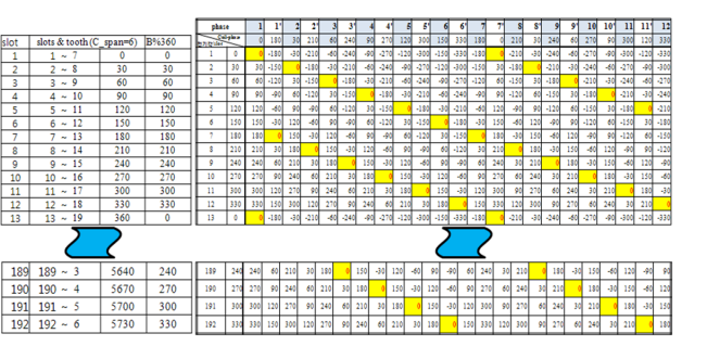
Fig. 1. Process of new coil arrangement method using electrical angle.