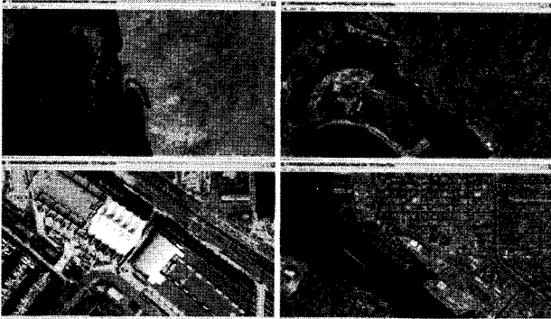
Figure 2. Multi-resolution X3D terrain tile set of San Diego, California generated from the terrain tile production chain

and USGS high-resolution orthoimage are used for the experiment. The highest resolution of orthoimage is 0.3m per a grid of pixel. Figure 2 shows different LOD level of generated X3D tile set. It is composed with 20 LOD levels with binary tree structure. Smooth transition between LODs depending on the distance from terrain surface to the viewpoint, real-time 3D examine and navigation, geo-referenced viewpoint handling with geographic coordinate and performance of X3D run-time architecture were validated with this experiments.