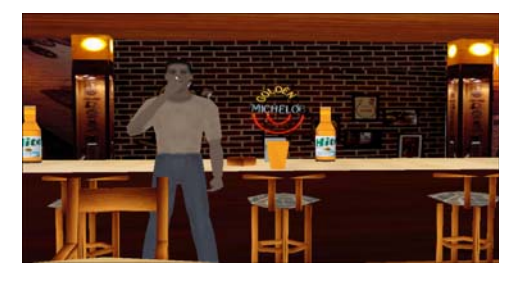
Fig 1. Virtual Bar

themes and took 10 days to complete. In session 1 (initial navigation), participants navigated freely around the bar. Cue exposure focused on person-elicited craving in session 2, object-elicited craving in session 3, and situation-elicited craving in session 4. In session 5, participants reviewed all the stimuli presented in session 2, 3, and 4. In session 6, participants navigated freely around the virtual bar again. Each session lasted for 20 min, including navigation, interviews about feelings, and completion of a questionnaire about craving.