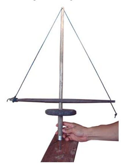
Figure 5: Manual Boring tools

'Bindu' is a manual boring-tool that was made from wood (tebelian), string and metal. The tool was looked so simple yet contributing much in wood-working long ago. The main portion is where the drill bit is attached. The string is attached to the other end of the main portion (top) as the axis of the tool. Both end of the string is attached to the horizontal wood inserted to the main portion. The concept of using the tools is like a 'yo-yo' games. Once the string intertwined with the main portion, the hand must be moved continuously (upwards and downwards) so that the drill bits keep on twirling.