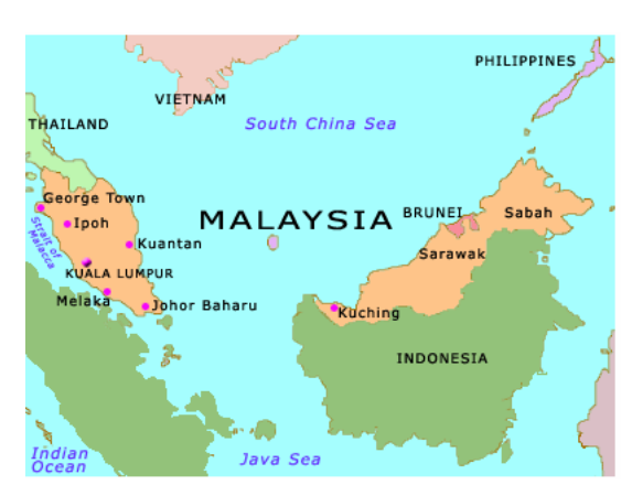
Figure 1: Map of Malaysia and Indonesia

The general objective of this project is to understand the functional artifacts of Borneo's indigenous design. The artifact will be enhanced through design development and apply the universal design principles.