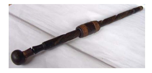
Figure 6: Primitive manual drill made from hard wood

The other type of boring tool is using a carved track on the main portion of the tool. Another piece of wood is placed outer part with a tracker grove inside. This part will twirl when it start to move the outer piece of wood upwards and downwards, following the track. The main portion will make the drill bit twirling as we make the movement continuously. This artifact has its own potential for a design enhancement due to its valuable manual mechanism and form follow function. The appreciation for the design is much deserved by the inventor as the artifact was made over a hundred years ago. The study case was done on the latter product which has derived from the earlier product.