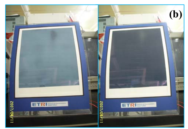
Fig. 3. Photographs of A4-sized electronic ink panel with an electrophoretic ink microcapsule diameter 50 \pm 10 \mu m in power-on state.