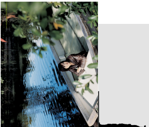
Fig. 3(a). Input image and its histogram (before processing)