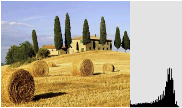
Fig. 2(a). Input image and its histogram (before processing)