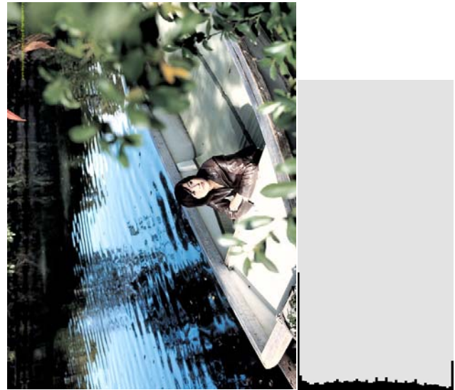
Fig. 3(b). Output image and its histogram (after processing)

Of course, we could find out that the area of grays in figure 3(b) spreads out more and figure 3(b) looks more vivid and brighter than figure 3 (a).