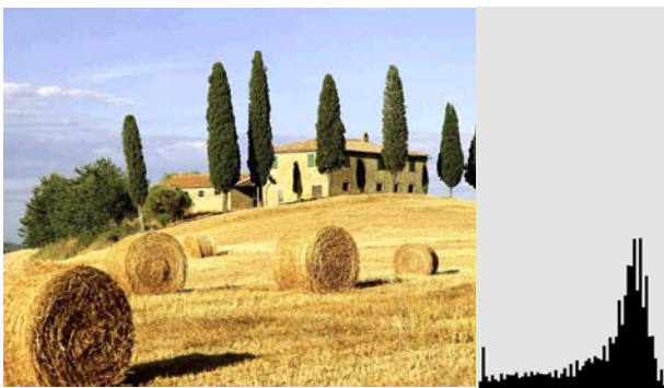
Fig. 2(b). Output image and its histogram (after processing)