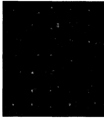
Fig. 2. Fluorescent image of dye material patterning.