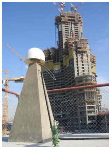
Figure 2: Continuous Operating Reference Station

After completion of observations, data is returned to the office for processing. Computation of GPS antenna positions is carried out, processed against data from a Continuously Operating GPS Reference Station Leica GRX1200 Pro with AT504 chokering antenna and Leica GPS Spider software, using Leica Geo Office software (LGO).