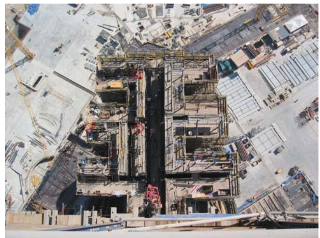
Figure 3: GPS active control points

To remove that restriction we have to consider this instrument as a local 3D axis system. The coordinates computed by using the observations (directions and distance) are internally consistent but must be transformed into the reference frame defined by the set of GPS antennas. In our case as we use a single total station, the problem is simply a 3D transformation also known as similarity transformation or Helmert transformation.