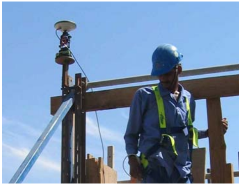
Figure 1: GPS and circular prism collocated

A circular prism is placed below each antenna and a Total Station instrument (TPS) is set up on the concrete visible to all GPS stations. The GPS plus TPS comprises a “measurement system”.