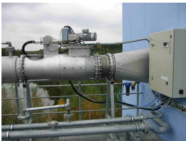
Fig. 2. TWISTER & MYTOS installation in a 400mm pipe on top of an aluminium plant

Figure 2 shows the Sympatec TWISTER & MYTOS laser diffraction on-line particle size analyser integrated into an atomisation process for aluminium powder while figure 3 presents typical process results as trend of characteristic values over time.