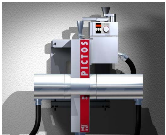
Fig. 4. PICTOS high speed at- & on-line particle size and shape analyser

Both instruments provide simultaneous information of particle size and particle shape on a million or more particles in only a few seconds and covers a particle size range from 1 to 20000 microns. The information about size and shape evaluated with the WINDOX instrument's control and evaluation software suite is permanently stored in more than 20000 size classes in a top speed multi-user client/server structured database. During measurement a video of the particles is created, which is stored together with the data on size and shape, and which is available at any time to apply sophisticated shape characterisation modes on the original data. A Particle Gallery supports an elegant way of finding the famous "needle in a haystack" or to sort the particles according to their size and shape