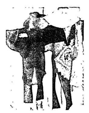
(Back of Work I, II)