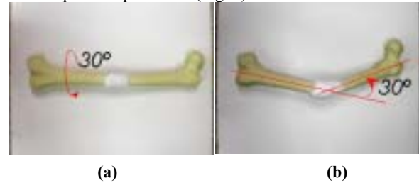
Fig. 2 Saw bone models for the simulation of bone deformity correction surgery. (a) CASE 1 is a mid-shaft malunion with 30° of rotational deformity. (b) CASE 2 is a mid-shaft malunion with 30° of varus angular deformity

mid-shaft malunion cases, a 30° of rotational deformity and a 30° of varus deformity, were tested for the validation of the robotic system (Fig. 2). Using the inverse kinematics analysis results and the corresponding graphic animation, the deformity correction surgery was performed based on the clinical operation procedure (Fig. 3).