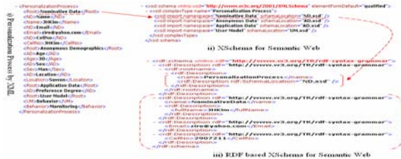
Fig.3 Personalization Process Module for Dynamic Interaction in Semantic web

framework for expressing this information so it can be exchanged between applications without loss of meaning. In this way, it result that personalization process module by XML Schema and RDF for Semantic web, we was capable of operating not only on multiple documents, but also on document fragments.