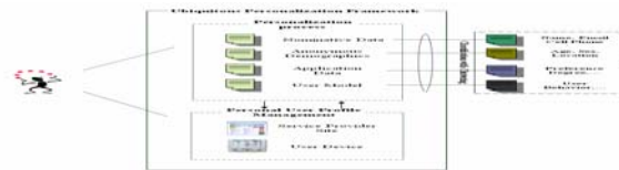
Fig. 1 Personalization Framework in Ubiquitous Environment

The personalization process consists of transforming a general incoming flow into a personalized outgoing flow. The flow data may consist of put together of actions, static information, and real-time stream. In order to perform its task, the personalization process would have a description of the flow data, which will allow it to understand the semantic of the information. This information can either be computed from the data for instance the e-commerce and m-commerce can be obtained from its user query keywords, or be expressed data as shown by a user profile. We call this information metadata in semantic web.[11] As metadata in semantic web, the personalization process relies on the user profile module, which manages information such as: i) name, email, cell-phone number and so on as nominative data. ii) age, sex, location, language etc as anonymous demographics by user profile. iii) preferences degree, applications' configurations, persistent state as application data. iv) user behavior. We shown as follow in Fig. 1