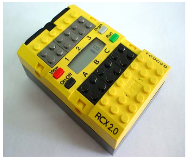
Fig.1 LEGO Mindstorm RCX

First of all, motors are included. The main purpose of motor is to make a robot to move. The basic set comes with two motors. We can create robots using the motor to move their hands, legs, wheels or even to shake hands. There is no limit in designing a robot. Two directly cabled motors will move exactly the same way. We can attach any motors to any ports as our wish.