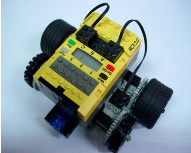
Fig. 3 Roverbot